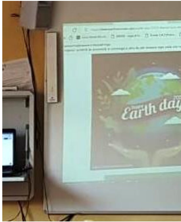
1 H class device