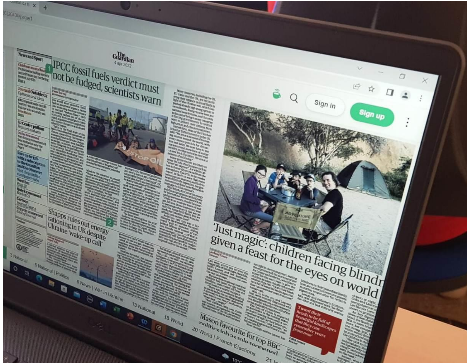
Students read about fossil fuels