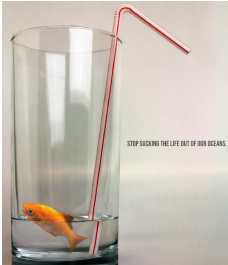
Stop Sucking The Life Out Of Our Oceans (Canada) — Young Reporters for the Environment (yre.global)