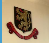
Visit to the Blankenberge Town Hall