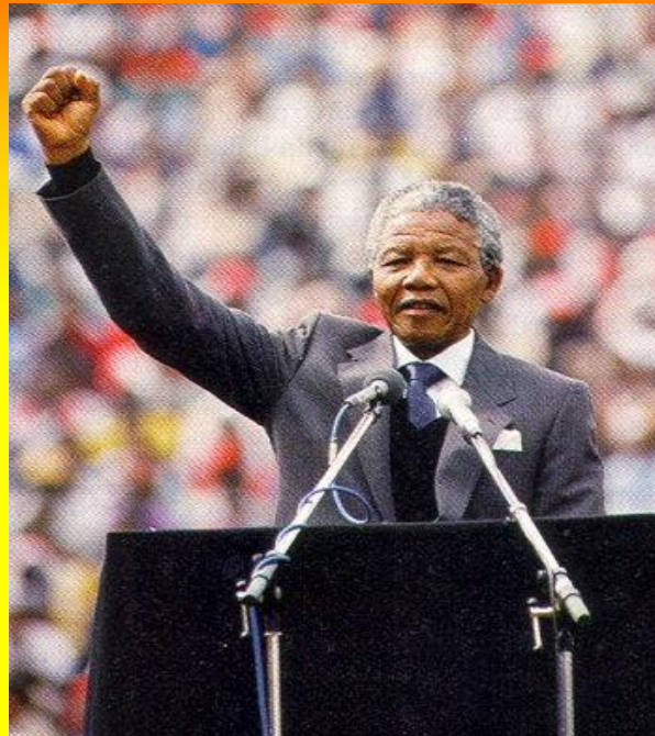
1994 Mandela became the first black president of South Africa.