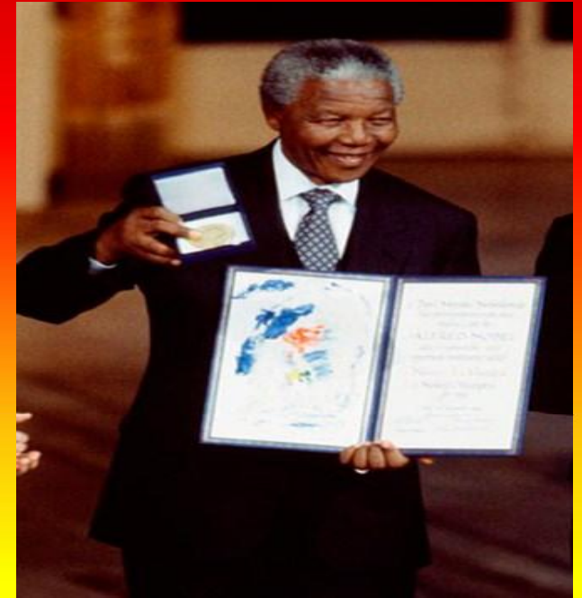
1993 Mandela won the Nobel peace prize.