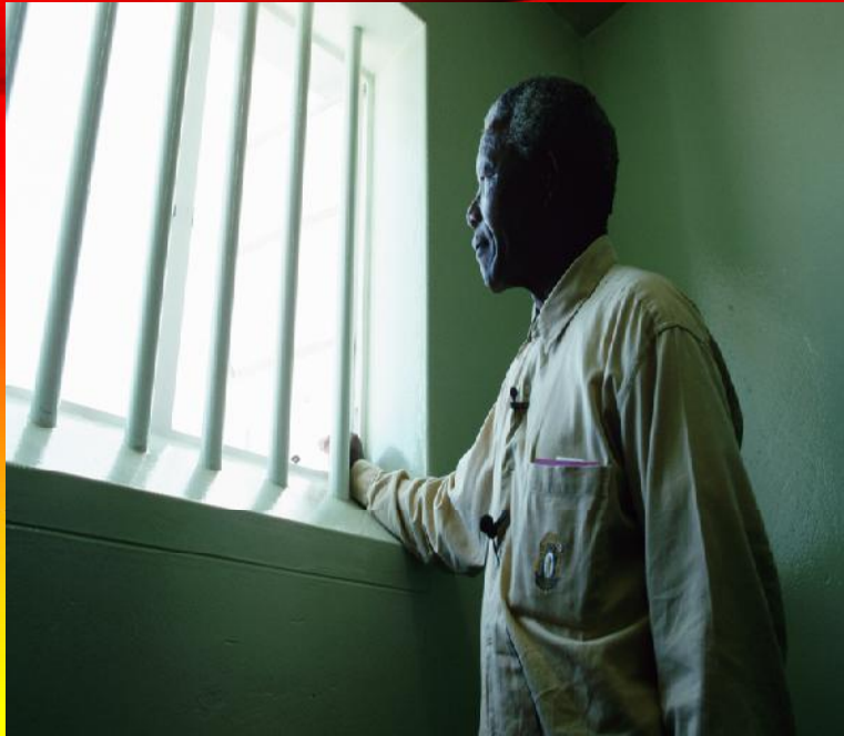
1953-1960 Mandela was arrested for being a leader of the ANC.